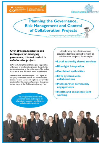
Planning the Governance, Risk Management and Control of Collaboration Projects