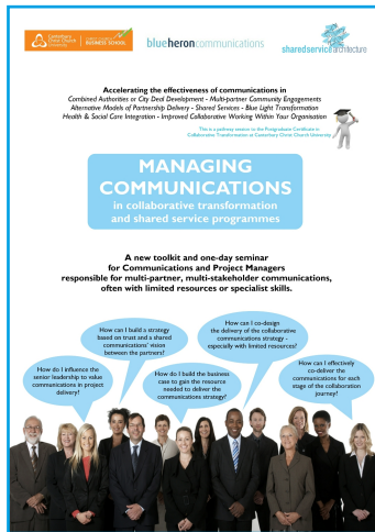
Managing Communications in Collaborative Transformation and Shared Service Programmes