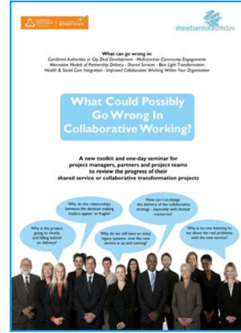
What Could Possibly Go Wrong in Collaborative Working and Shared Services?