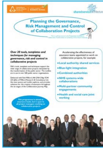
Planning the Governance, Risk Management and Control of Collaboration Projects