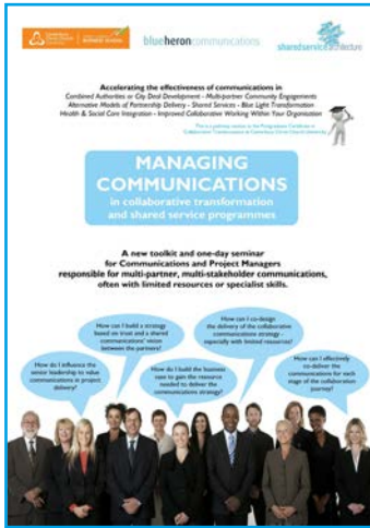
Managing Communications in Collaborative Transformation and Shared Service Programmes